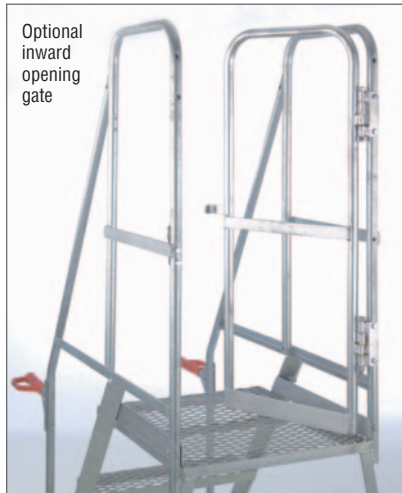
Optional inward opening gate

The steps have two handles at the front, fitted with knuckle guard hand grips for lifting. This facilitates mobility of the unit on the two fixed rear nylon 100mm castors.