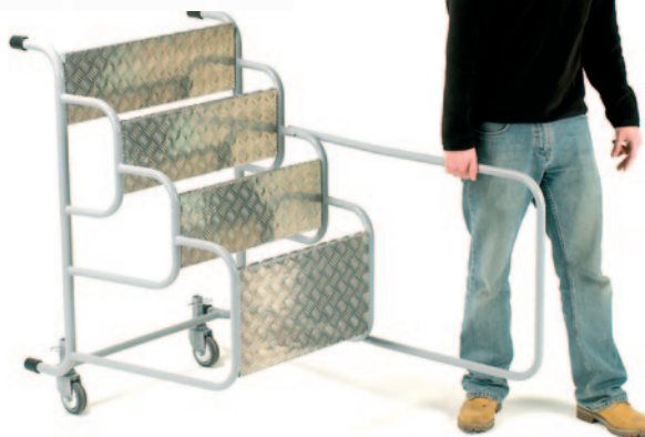
MCS04Z fitted with MCSHR4 and MCS01W

Wheels can be positioned within the frame or outside the frame for manoeuvring.