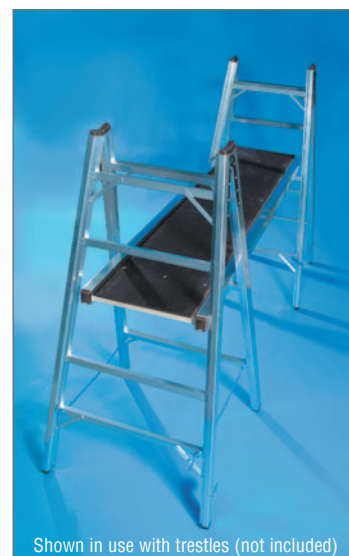
Shown in use with trestles (not included)