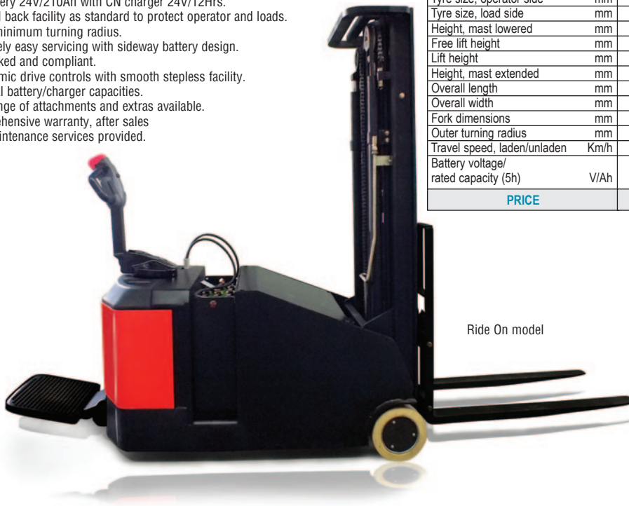
Ride On model