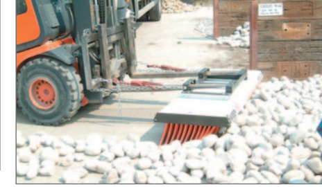
Sweep anything from dust to small boulders