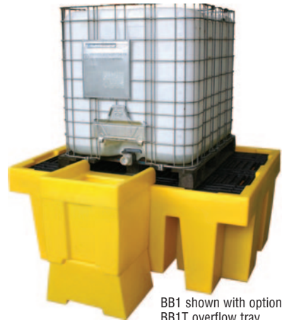
BB1 shown with optional BB1T overflow tray