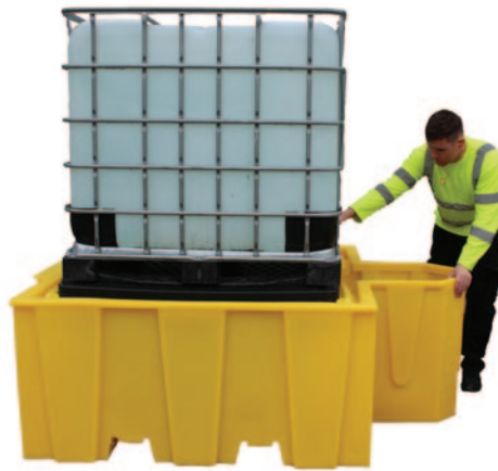
BB1D has a secondary containment solution with an integral dispensing area