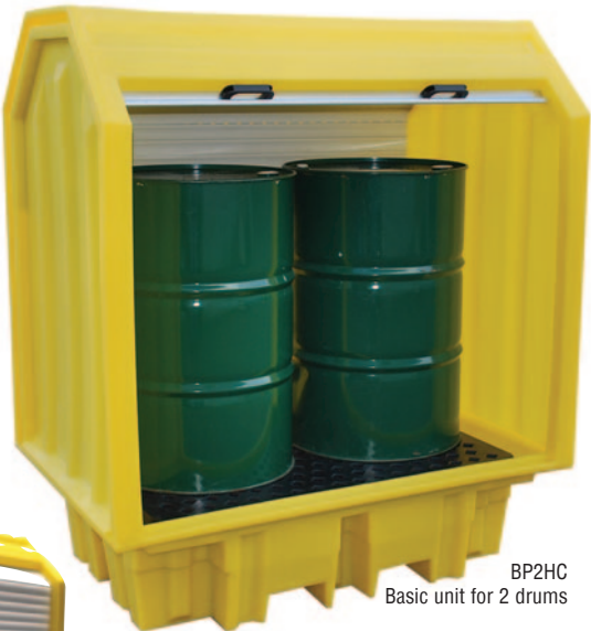
BP2HC Basic unit for 2 drums