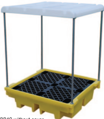
BP4C without cover