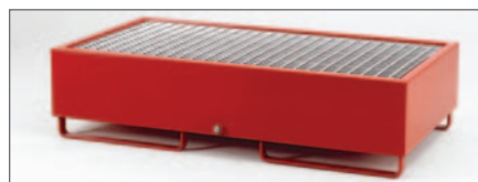
DS401 stores 2 vertical drums