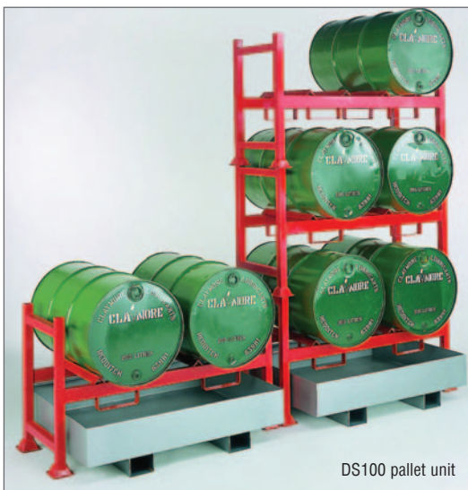
DS100 pallet unit