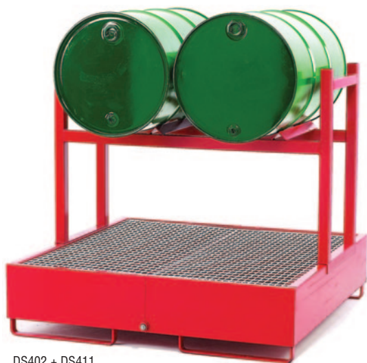
DS402 + DS411