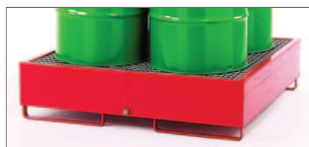
DS402 stores 4 vertical drums