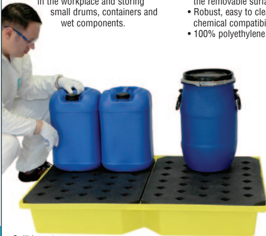
Spill base trays