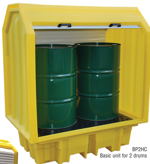
BP2HC Basic unit for 2 drums