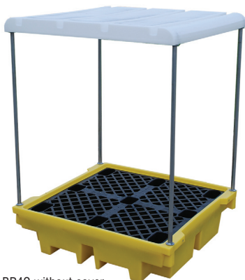
BP4C without cover