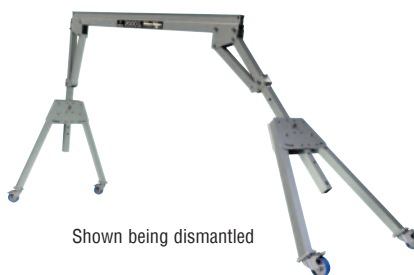
Shown being dismantled