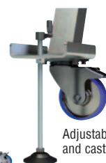
Adjustable feet and castor