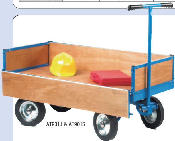
AT901J & AT901S