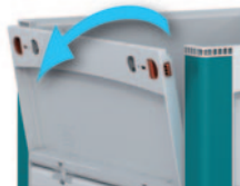
Optional drop down picking door available