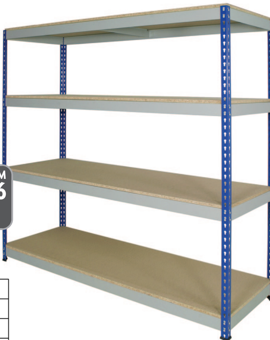
Available Heights (mm)