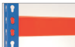
Blue & orange