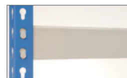
Blue & grey