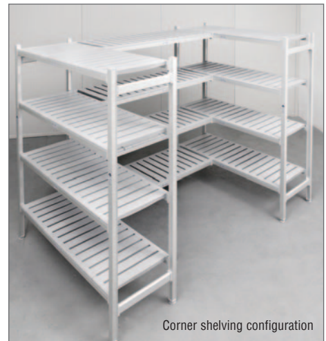
Corner shelving configuration