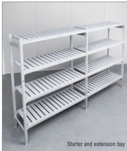
Starter and extension bay