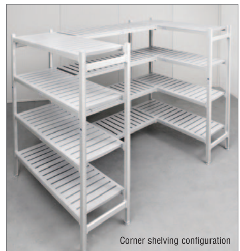
Corner shelving configuration