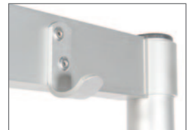
Standard hooks supplied in silver.