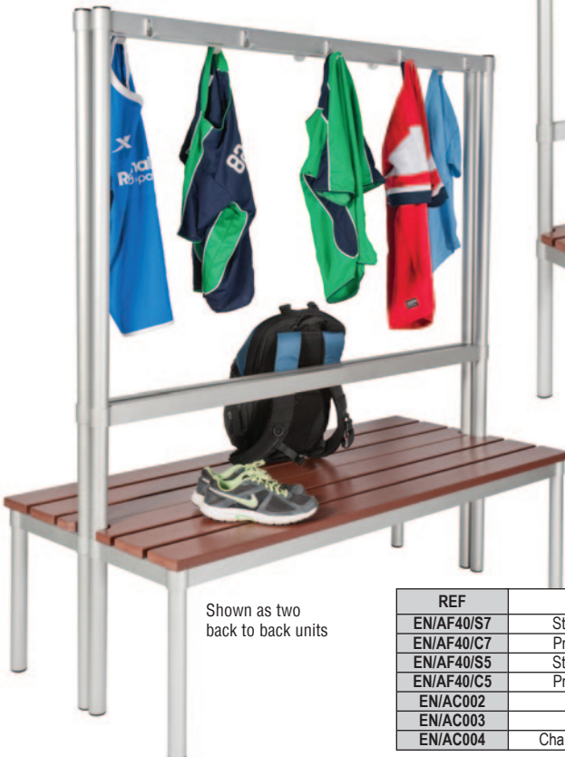
Shown as two back to back units