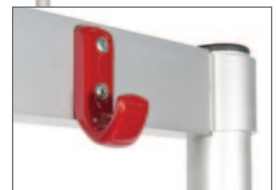
Premium hooks available in choice of 6 colours, please state colour required.