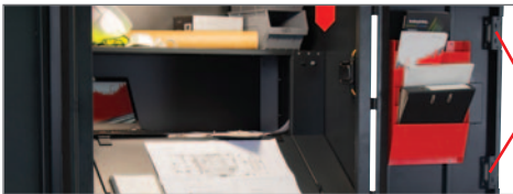
Keyed alike 2 point locking system