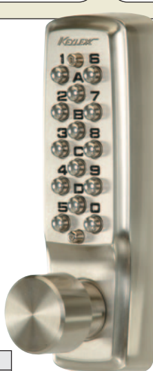
2100 Heavy Duty