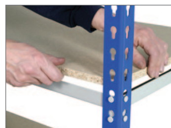
WORKBENCHES FITTED WITH CHIPBOARD SHELVES