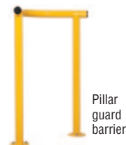
Pillar guard barrier