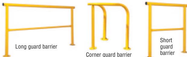
Long guard barrier