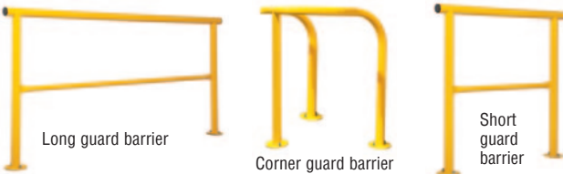
Long guard barrier