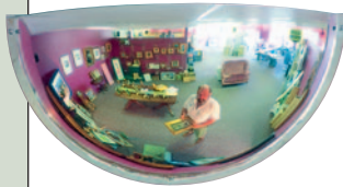
Half face wall mirror