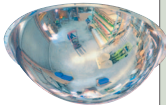
Full face ceiling dome