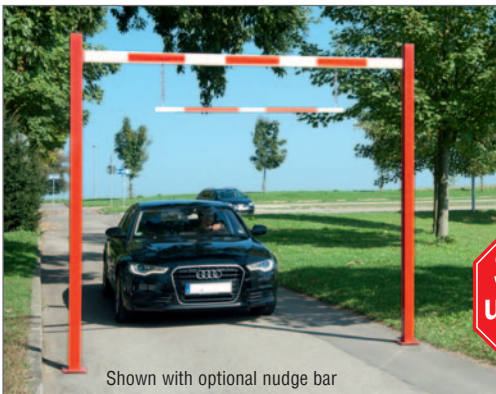
Shown with optional nudge bar