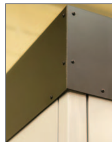
Pre-made corner channel

There are many, many options available with this product so please contact us for full details and pricing. We can offer assistance with the design and also provide an installation service should you require it.