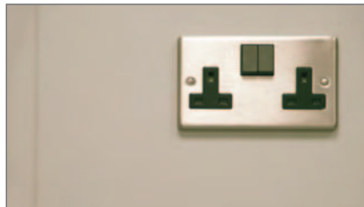
Factory fitted flush sockets