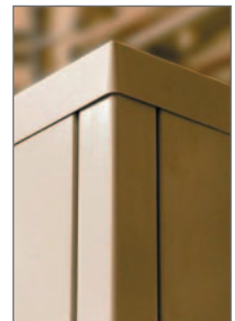
Top panel finish