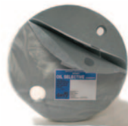
Oil drum top cover

Cut to fit 205 litre drum cover. Stop drips from reaching the floor and promote good house keeping.