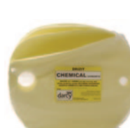
Chemical drum top cover