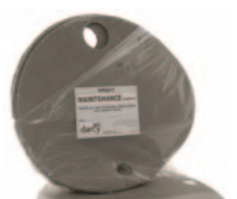
Maintenance drum top cover