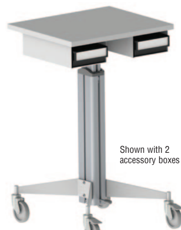
Shown with 2 accessory boxes