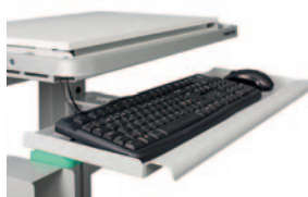
Optional keyboard tray if using workstation with a laptop/tablet