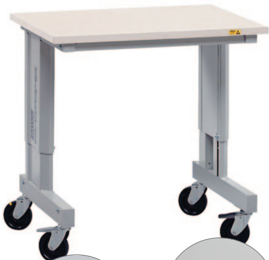
Standard laminate bench top