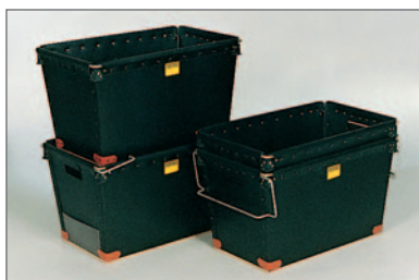
Stack & Nest