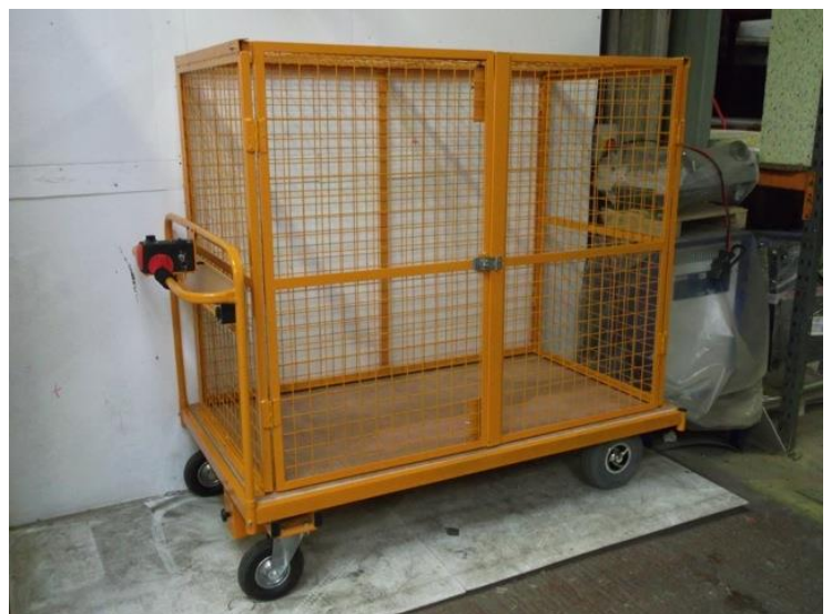
HI-POW-1580 with detachable and lockable security cage